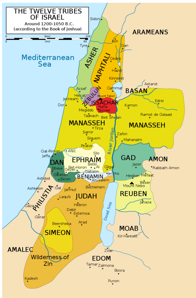
Location of Ephraim

Judges 1:34-35 Then the Amorites forced the sons of Dan into the hill country, for they did not allow them to come down to the valley; 35 yet the Amorites persisted in living in Mount Heres, in Aijalon and in Shaalbim ; but when the power of the house of Joseph grew strong, they became forced labor.