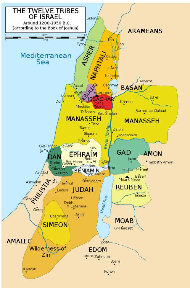
Location of Ephraim

Judges 1:34-35 Then the Amorites forced the sons of Dan into the hill country, for they did not allow them to come down to the valley; 35 yet the Amorites persisted in living in Mount Heres, in Aijalon and in Shaalbim ; but when the power of the house of Joseph grew strong, they became forced labor.